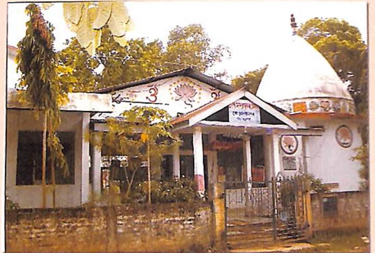
Merghar Shiva & Kali Mandir