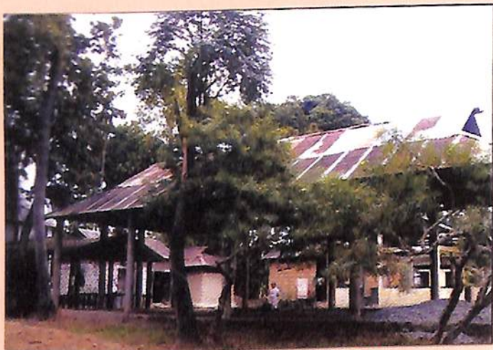
Jarpara Buragohain Than