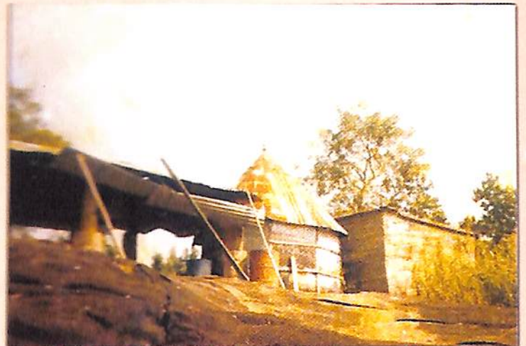
Gobardhan Pahar Bishnu Mandir