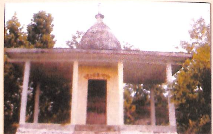
Gobardhan Pahar Hara-Gouri Mandir